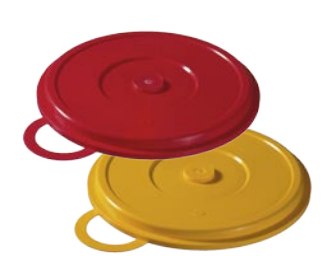
Synthetic lid with ring tab 9931RLR color red 9931RL color yellow