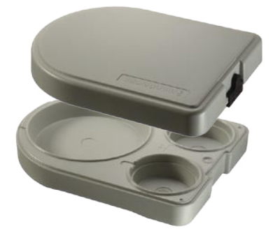
Menü Mobil Classic, consisting of 66600 Upper part 66610 Lower part N7770 Slide lock Measurements: 395 x 310 x 100 mm color gray