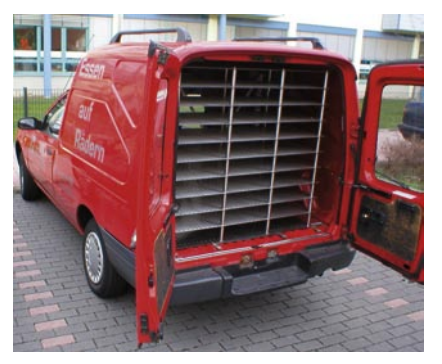
Shelf system, individually customized to your vehicle, in module construction.